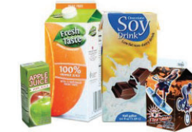
Milk Cartons & Juice Boxes