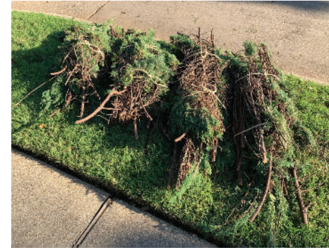
Examples of Bundled Brush

Bundled brush cannot exceed four feet by two feet nor weigh more than 50 pounds per bundle. Tied and bundled brush may be set out in UNLIMITED QUANTITIES on your second trash day.