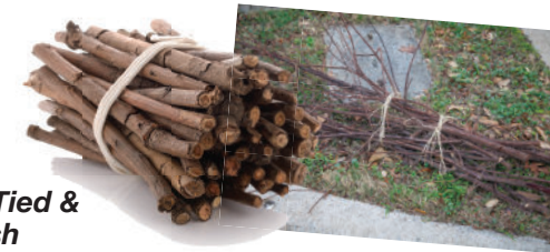
Examples of Tied & Bundled Brush

Have bulk items that exceed the acceptable limit or loose (unbundled) brush? Want it all picked up at once? Please contact CWD for a price quote.