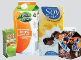
Milk Cartons & Juice Boxes