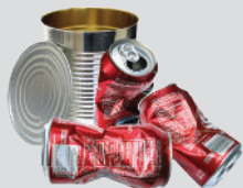
Aluminum, Steel, & Tin Containers