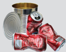
Aluminum, Steel, & Tin Containers