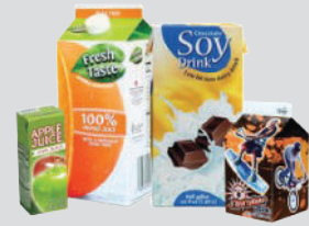
Milk Cartons & Juice Boxes