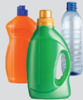
Plastic Containers #1-5 & #7