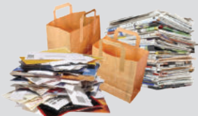
Mixed Paper, Newspaper, etc.