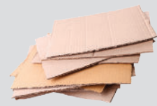
Corrugated Cardboard & Boxboard