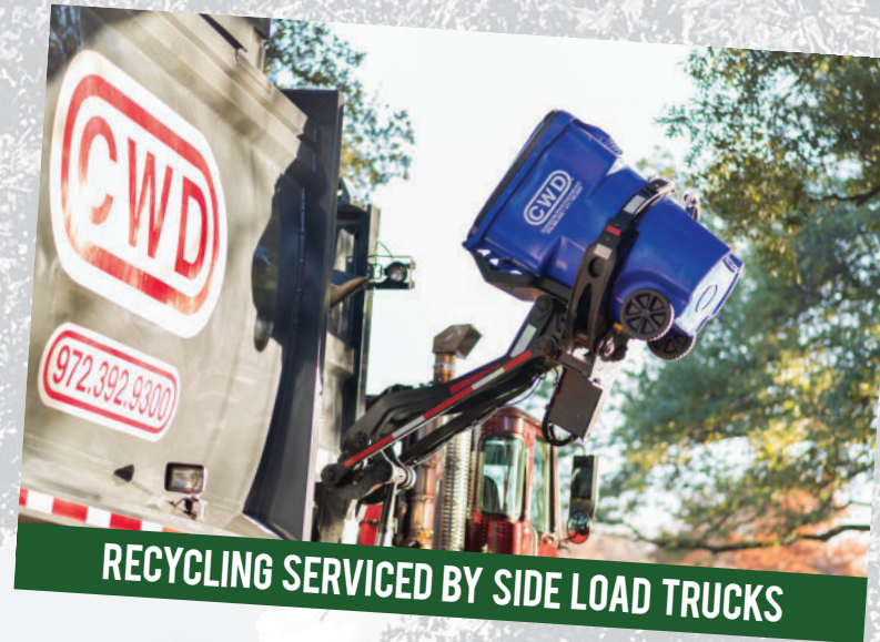
RECYCLING SERVICED BY SIDE LOAD TRUCKS

CWD Customer Service 972.392.9300 Option 2