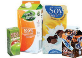
Milk Cartons & Juice Boxes