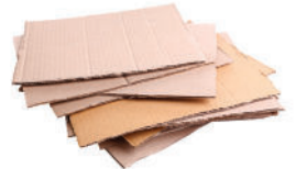
Corrugated Cardboard & Boxboard