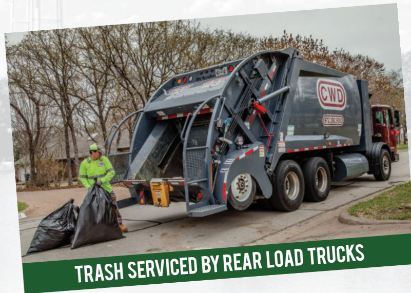
TRASH SERVICED BY REAR LOAD TRUCKS

CWD Customer Service 972.392.9300 Option 2