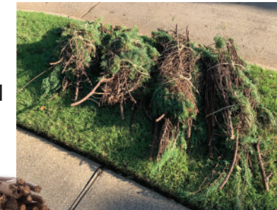
Examples of Bundled Brush