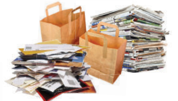
Mixed Paper, Newspaper, etc.