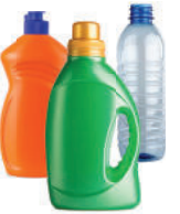
Plastic Containers #1-5 & #7