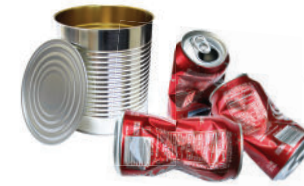
Aluminum, Steel, & Tin Containers