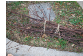
Examples of Bundled Brush

ALL BRUSH MUST BE TIED AND BUNDLED. Bundled brush cannot exceed four (4) by two (2) feet or weigh more than 40 pounds per bundle.