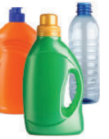
Plastic Containers #1-5 & #7