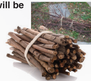
Examples of Bundled Brush

Tied and bundled brush will be collected, in unlimited quantities , once a week on your regular trash pickup day. Tied and bundled brush must weigh less than 50 lbs., and be no longer than four feet.