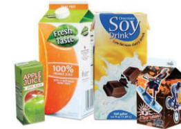
Milk Cartons & Juice Boxes