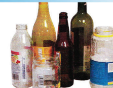
Glass Bottles & Containers Botellas y Envases de Vidrio