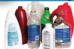
Plastic Containers #1 - 5 & #7 (No Styrofoam) Recipientes de Plástico Número Uno hasta Siete (No Poliestireno)