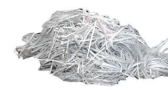
Shredded Paper Papel Picado

More "No" Materials: Ceramics, Dishes, Coffee Mugs, Drinking Glasses, Light Bulbs, Pyrex, Flammable, Toxic, Hazardous, Medical Waste and Syringes