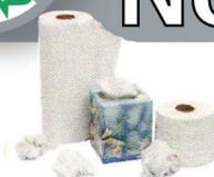
Paper Towels, Facial Tissue & Toilet Tissue Toallas de Papel, Papel de Seda y Papel Higiénico