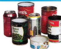
Aluminum, Steel & Tin Containers Latas de Aluminio, Acero y Estaño