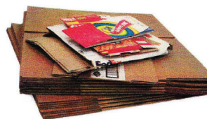
Corrugated Cardboard & Boxboard Cajas de Cartón & Cartulina Gris