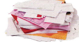
Mixed Paper Papel Mixto

Print a full-size copy of the Yes/No Recycling chart at www.CWD.to