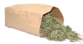
Grass Clippings Recortes de Césped