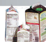
Wax-Coated Paper Drink Containers Recipientes de Papel Encerado para Bebidas