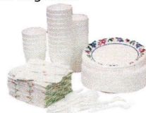
Paper, Plastic & Styrofoam Serving Items Platos, Tazas Y Utensilios De Servir de Papel, Poliestireno y Plástico