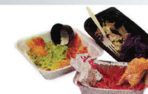
Food & Wet Waste Comida y Desperdicios Húmedos