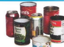
Aluminum, Steel & Tin Containers Latas de Aluminio, Acero y Estaño