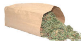
Grass Clippings Recortes de Césped