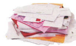
Mixed Paper Papel Mixto