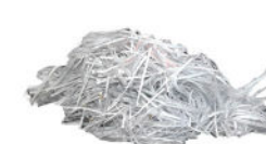
Shredded Paper Papel Picado

More "No" Materials: Ceramics, Dishes, Coffee Mugs, Drinking Glasses, Light Bulbs, Pyrex, Flammable, Toxic, Hazardous, Medical Waste and Syringes