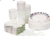
Paper, Plastic & Styrofoam Serving Items Platos, Tazas Y Utensilios De Servir de Papel, Poliestireno y Plástico