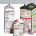
Wax-Coated Paper Drink Containers Recipientes de Papel Encerado para Bebidas