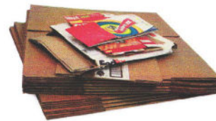
Corrugated Cardboard & Boxboard Cajas de Cartón & Cartulina Gris