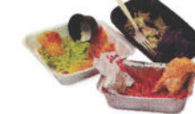
Food & Wet Waste Comida y Desperdicios Húmedos