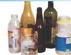
Glass Bottles & Containers Botellas y Envases de Vidrio