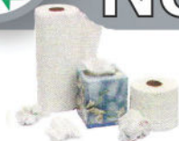
Paper Towels, Facial Tissue & Toilet Tissue Toallas de Papel, Papel de Seda y Papel Higiénico