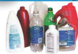
Plastic Containers #1 - 5 & #7 (No Styrofoam) Recipientes de Plástico Número Uno hasta Siete (No Poliestireno)