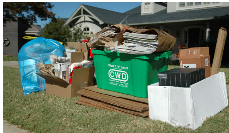
18 Gallon Green Bins Placing excess recyclables outside the bin is acceptable

Choose between an 18 gallon green bin or a 65 gallon blue cart