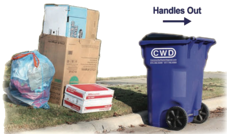
65 Gallon Blue Carts Placing excess recyclables outside the cart is acceptable